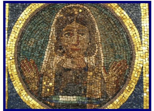
Woman at Prayer - Cristiano Museum, Vatican

Give us your vision, so that through us, you will indeed renew the face of the earth. We ask this through Jesus Christ, our Lord. Amen.