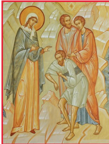
Fresco (detail) St. Genevieve, Russian Orthodox Seminary in France