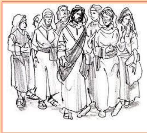
Women Disciples by Pat Marrin NCR Online